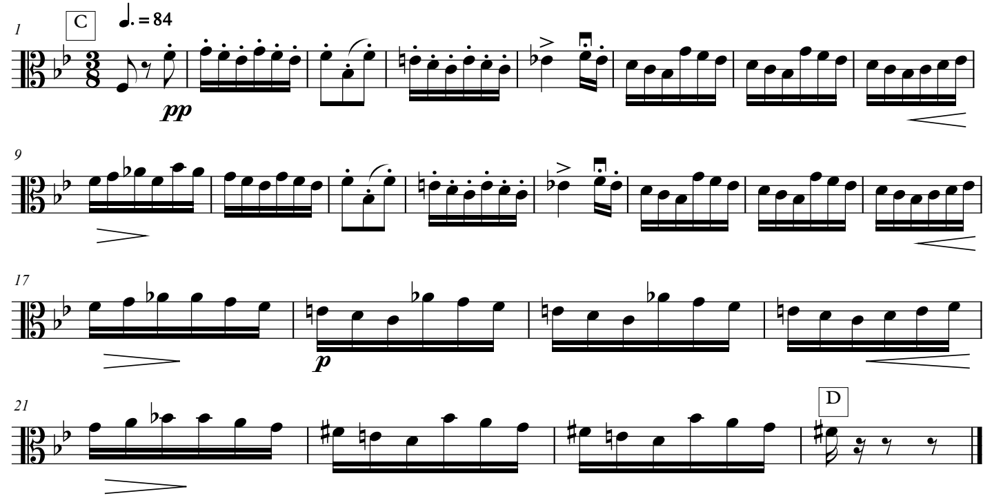
2. Prepare a 3-4 minute solo or etude that best demonstrates your level of playing ability.